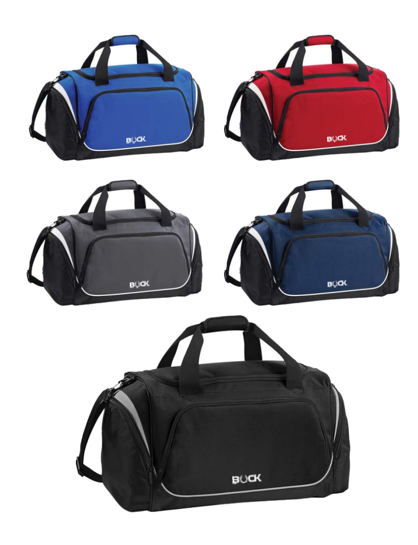
Multi pocket player holdall.