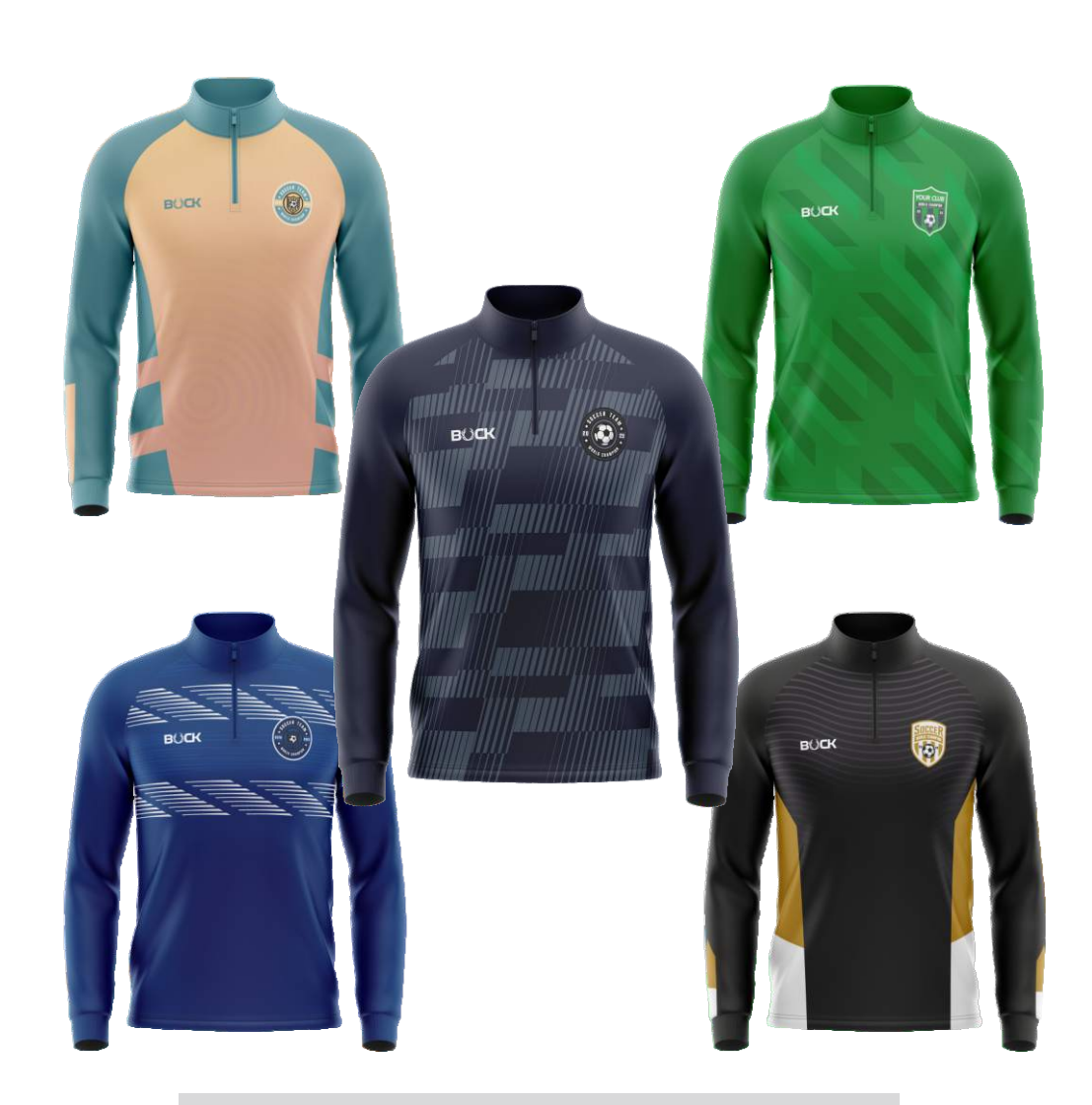
Custom Print. Summer or Winter weight

Custom Print. 1/4 or Full zip available.