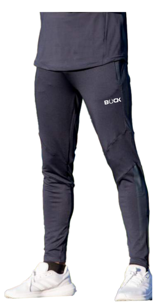
Skinny Tracksuit Bottoms