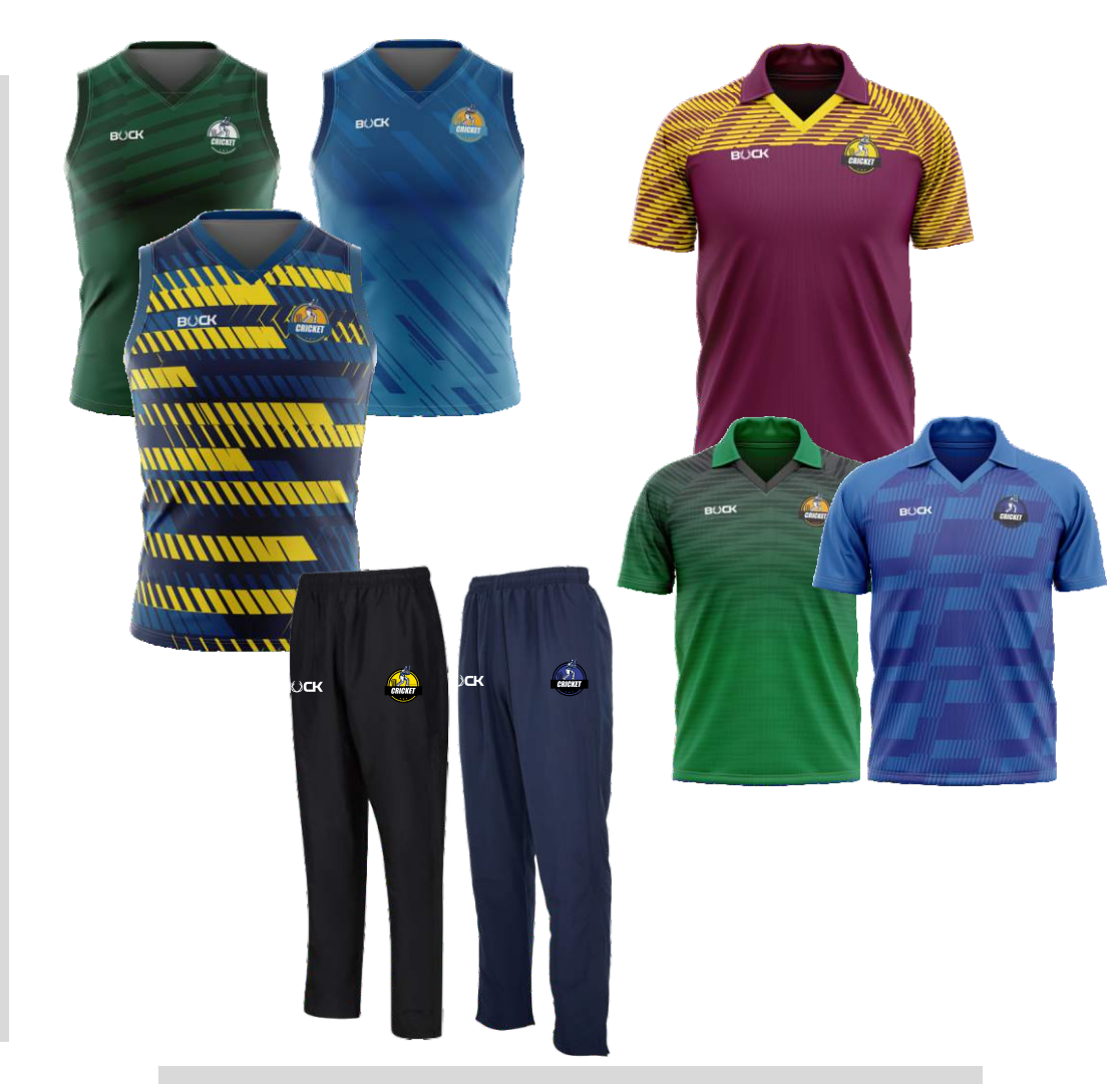
One day & T20 range with all details printed into the material at no extra cost.