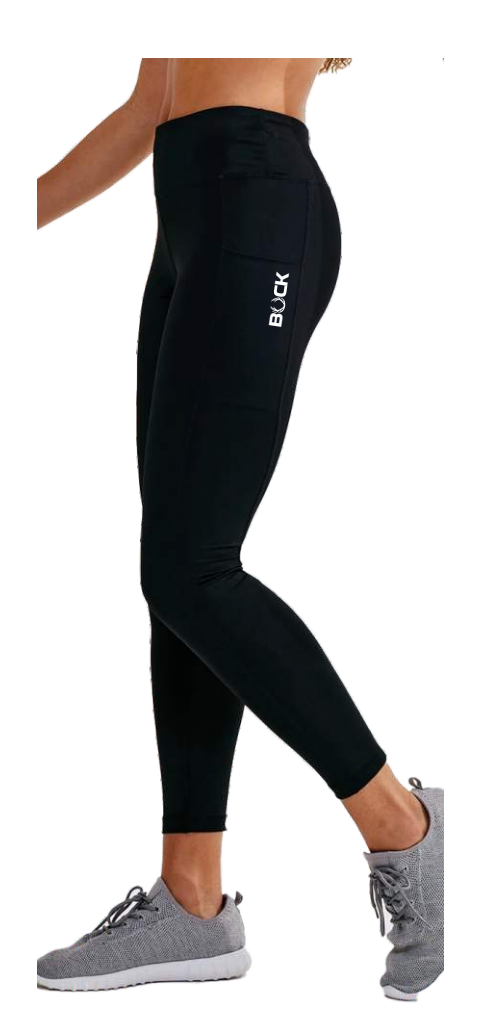
Leggings with side pocket