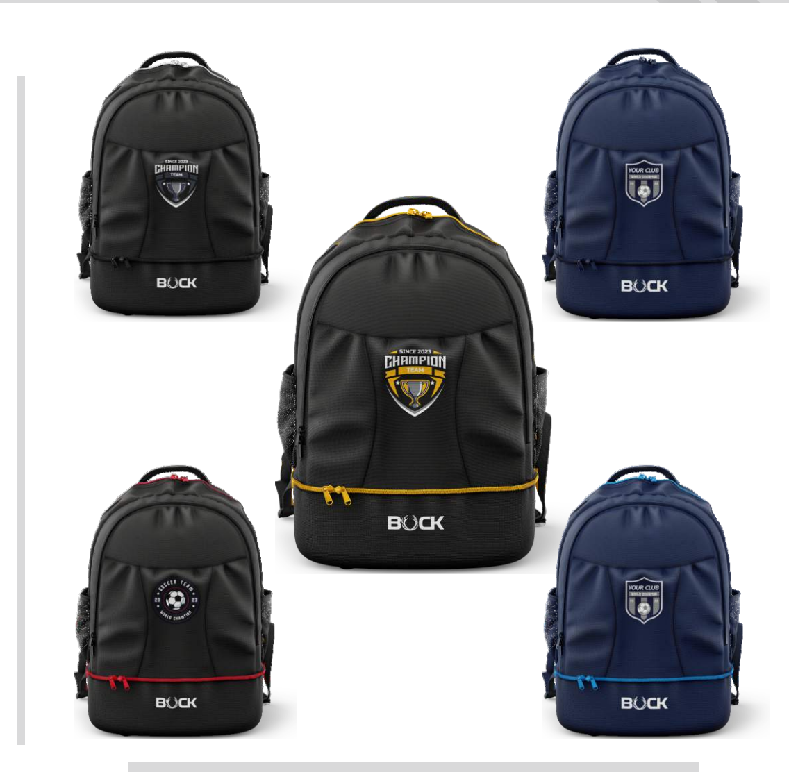
Rucksack with hard base boot compartment. Almost any colour available. Any zip colour.